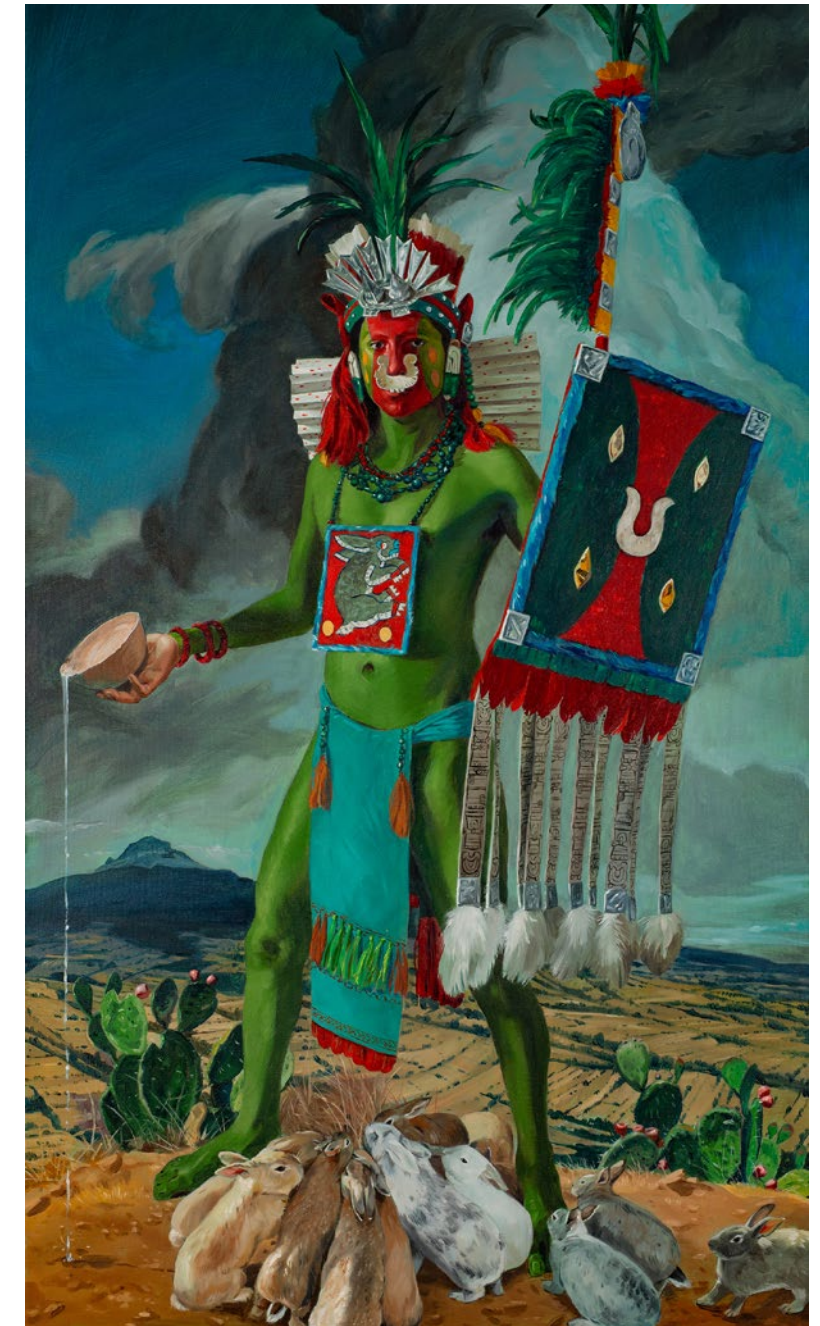
CHICOME ITZCUINTLI AMATLAPALLI