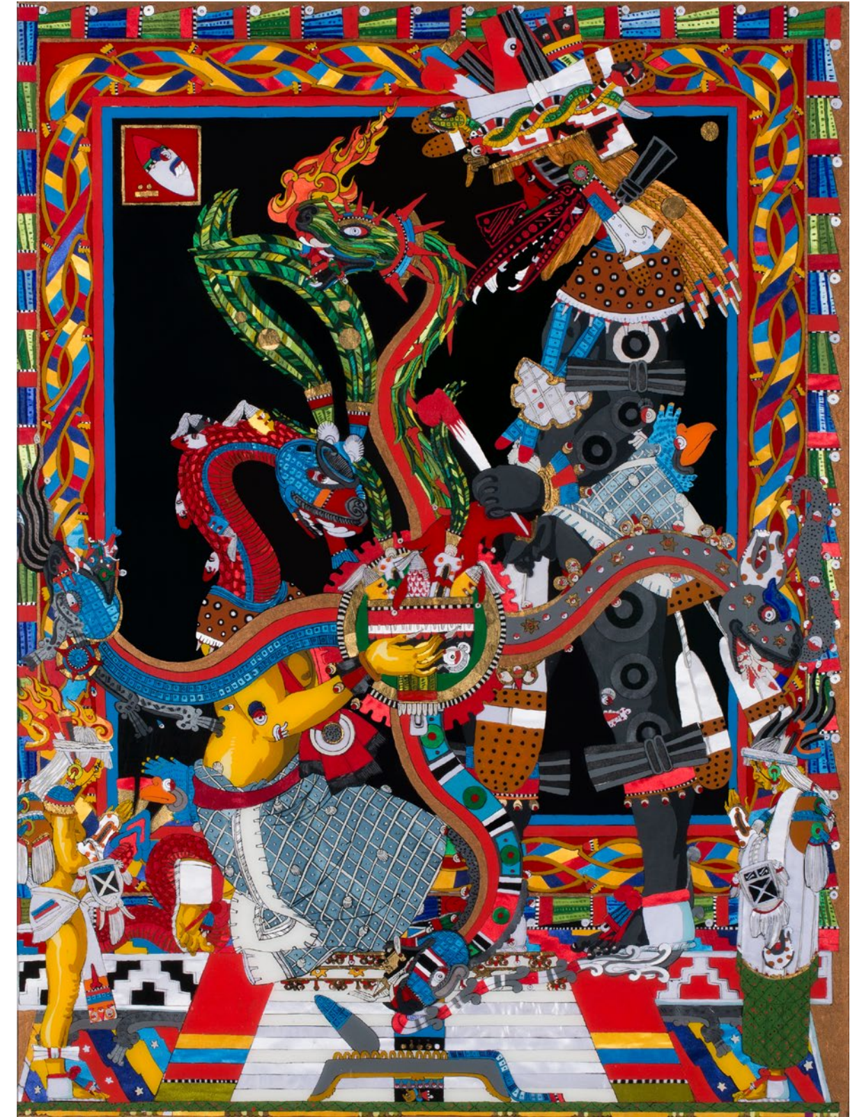
CHICOME ITZCUINTLI AMATLAPALLI

“La creación de los primeros hombres,” 2017