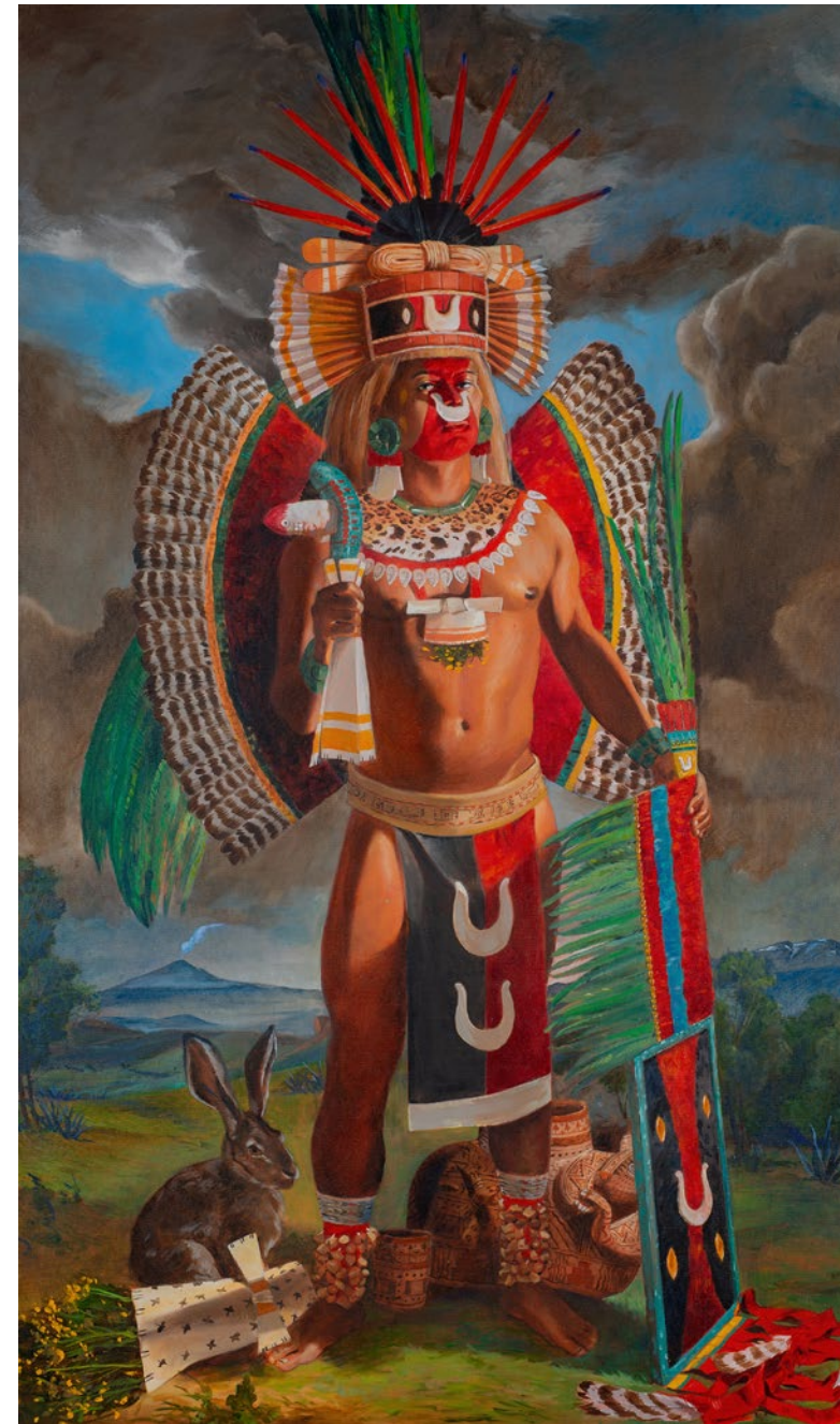
CHICOME ITZCUINTLI AMATLAPALLI