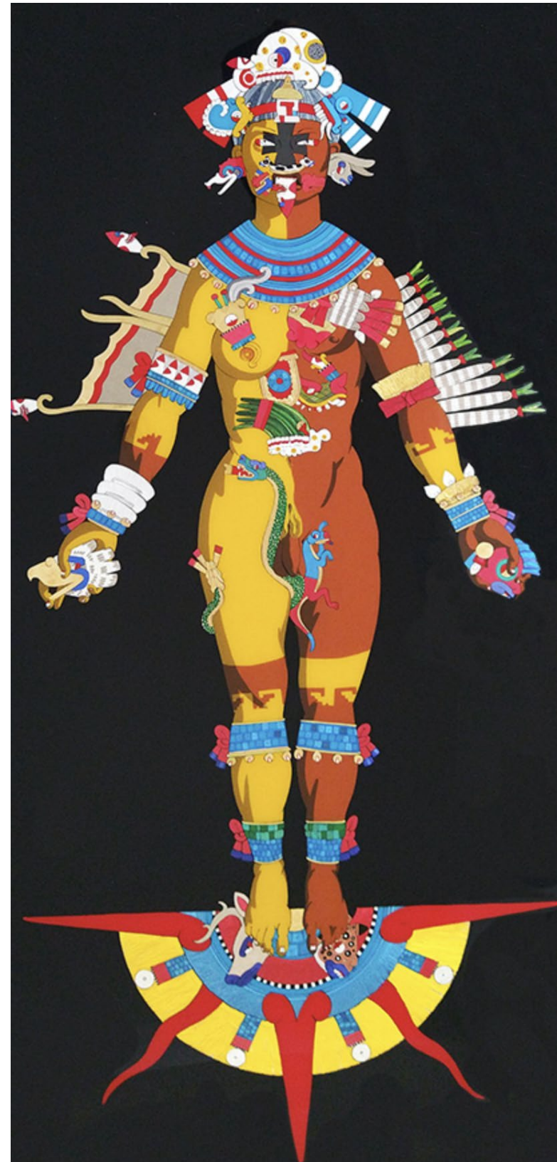
CHICOME ITZCUINTLI AMATLAPALLI

"Dualidad vida y muerte," 2018 Fabric and acrylic on plexiglass 186.5 x 91.5 cm