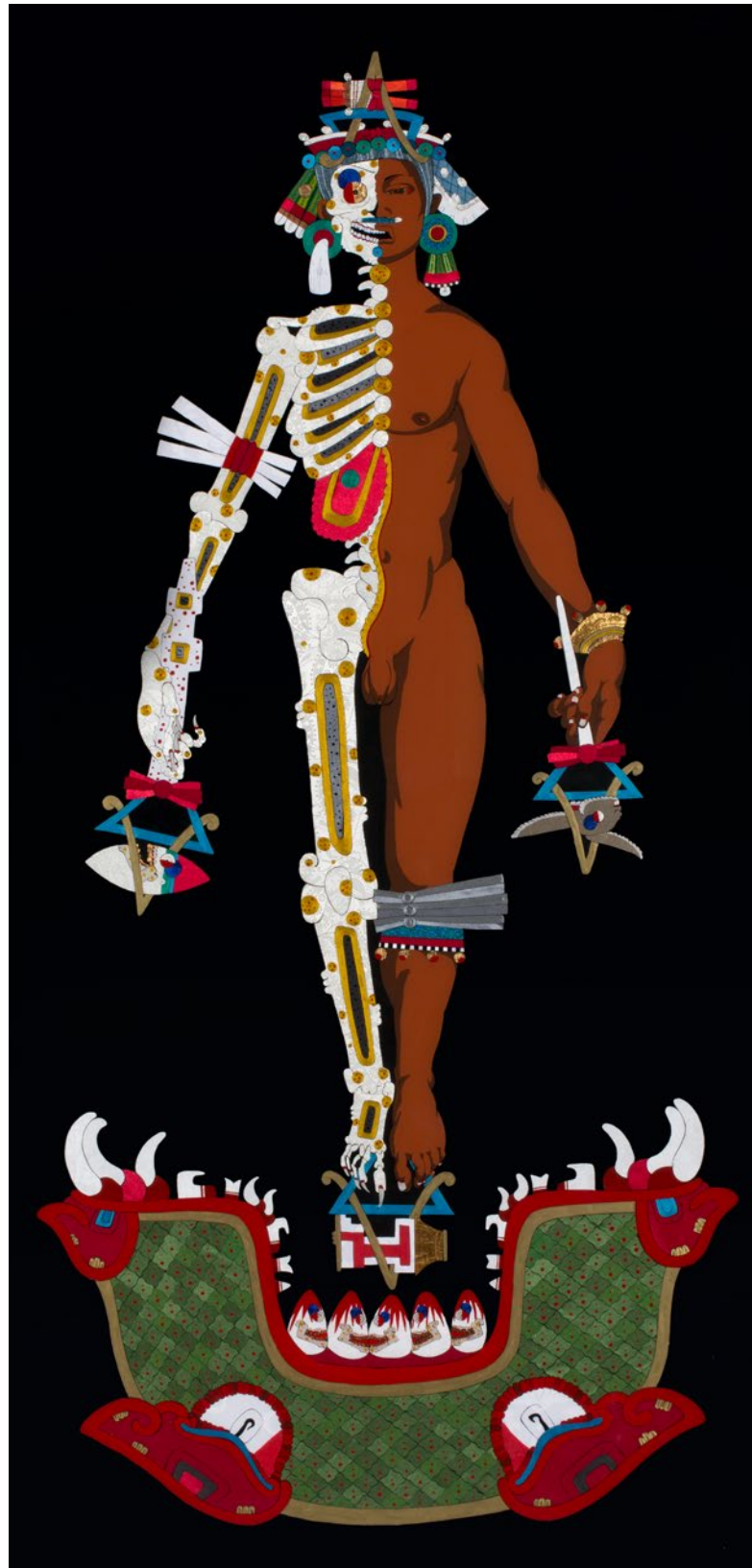
CHICOME ITZCUINTLI AMATLAPALLI

"Dualidad vida y muerte," 2018 Fabric and acrylic on plexiglass 186.5 x 91.5 cm