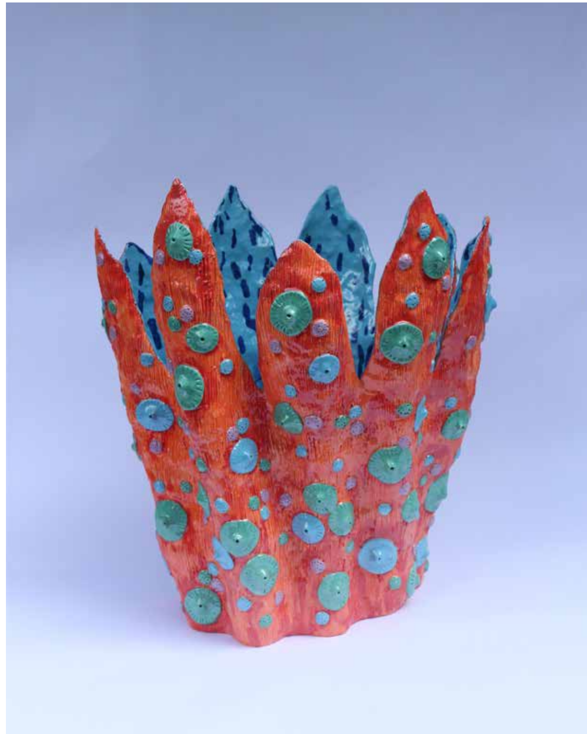
GUADALUPE QUESADA "Gorgonia," 2022 Ceramics and glazes 43 x 35 x 40 cm