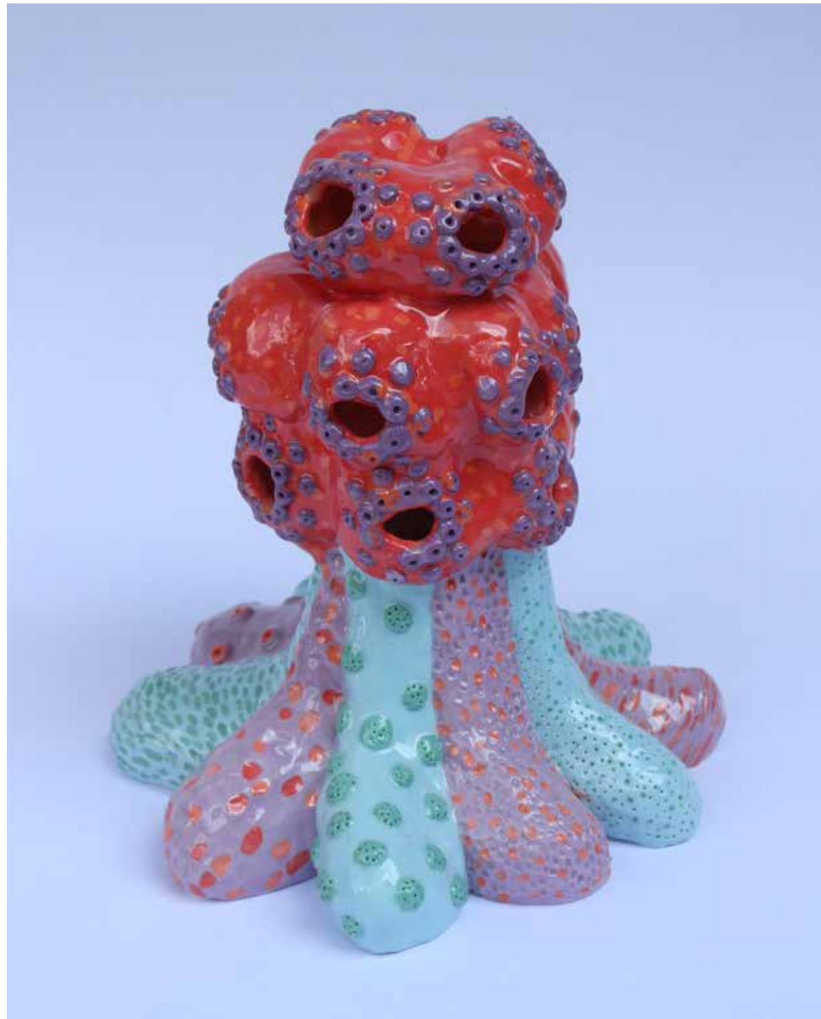
GUADALUPE QUESADA "Hapalochlaena," 2022 Ceramics and glazes 28 x 25 x 30 cm